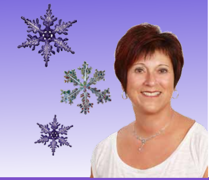
peace, joy and love of the season ... happiness in a world of peace

As I write this, the landscape is hastily preparing itself for winter; the most obvious is the trees saying good-bye for the long winter's sleep. But, despite the snow which may or may not cover the ground in your area, the cold, and the early darkness, we are entering a few weeks of light and warmth with families and friends as we celebrate the Christmas season.