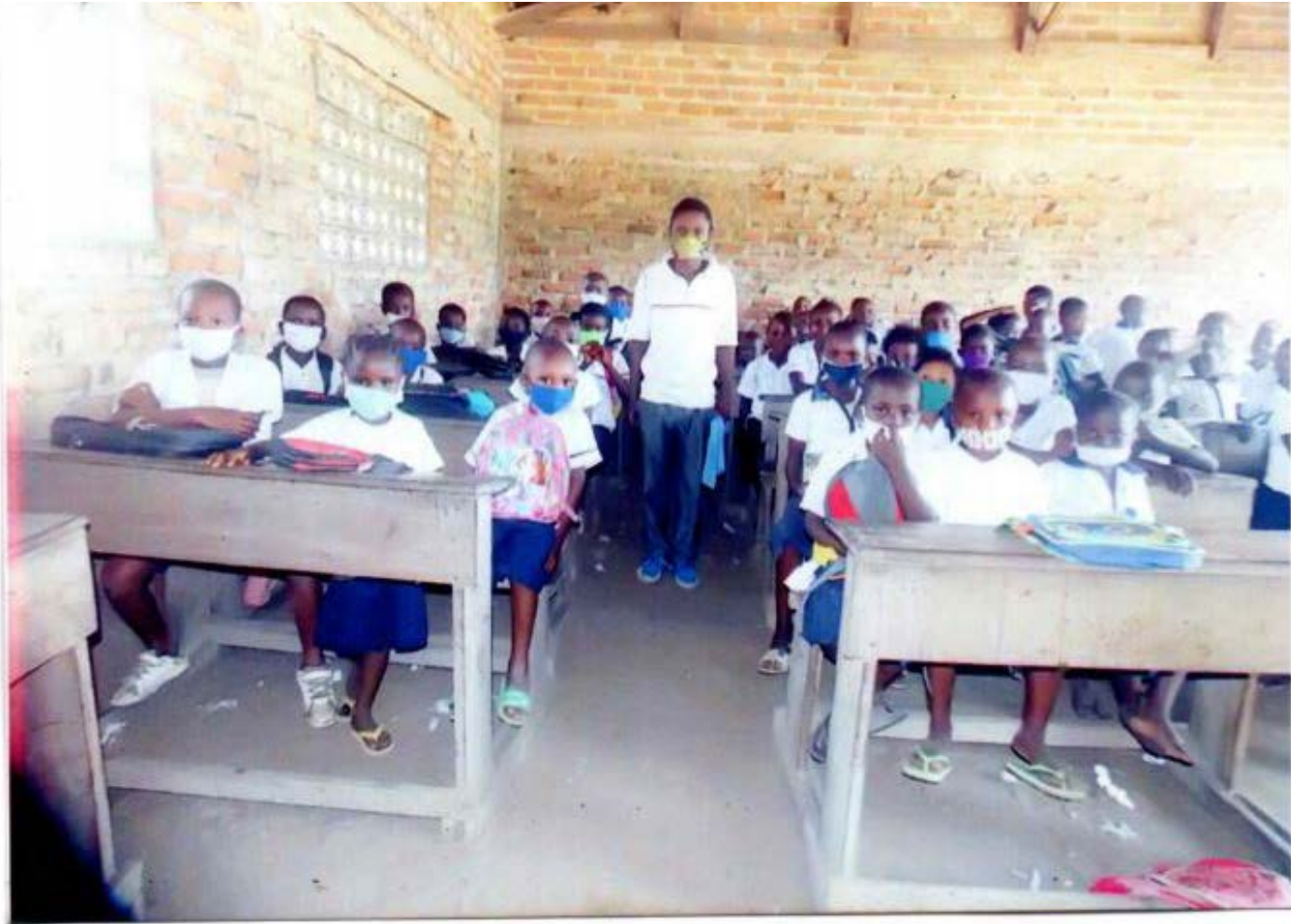
Projet Terre, Congo