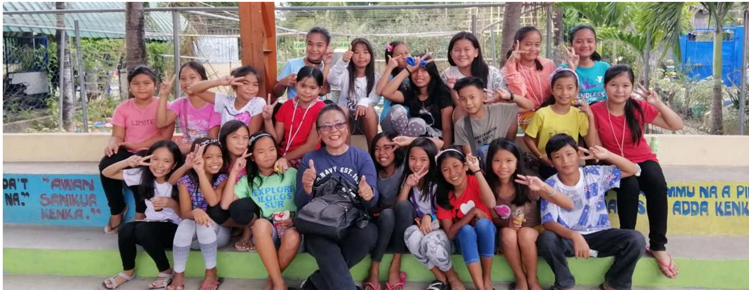
Childhope Philippines Foundation, | Quezon City, Philippines