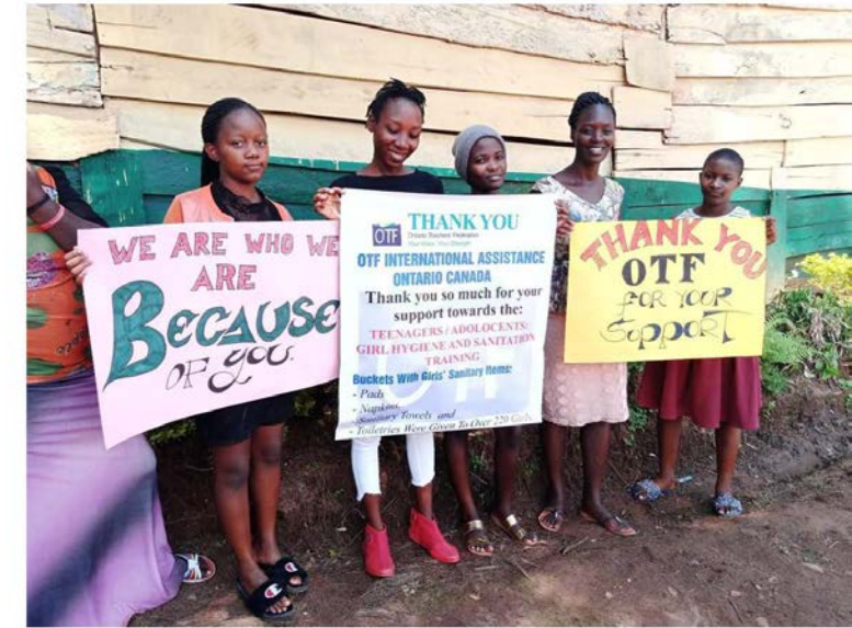
“Joy Bucket” of sanitation items, Girls in Red, Uganda