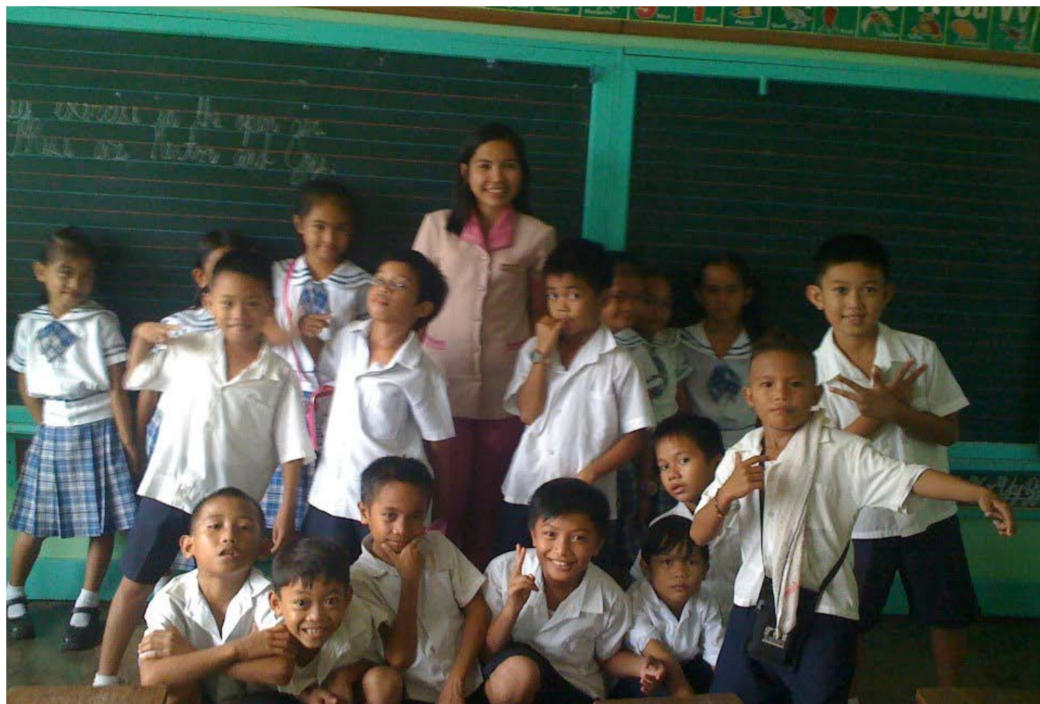
New Hope Elementary School, Manila, Philippines