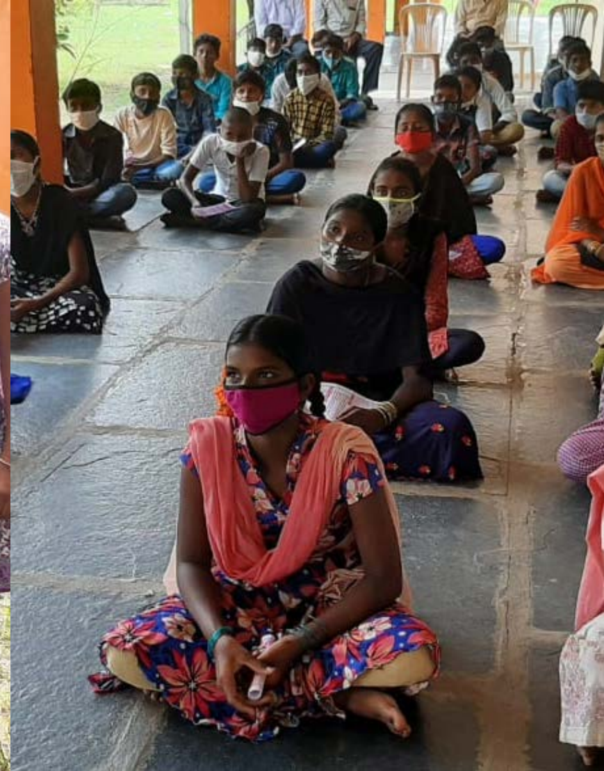
Green Schools Program - Tree Plantation and Environmental Education project, Andhra Pradesh, India