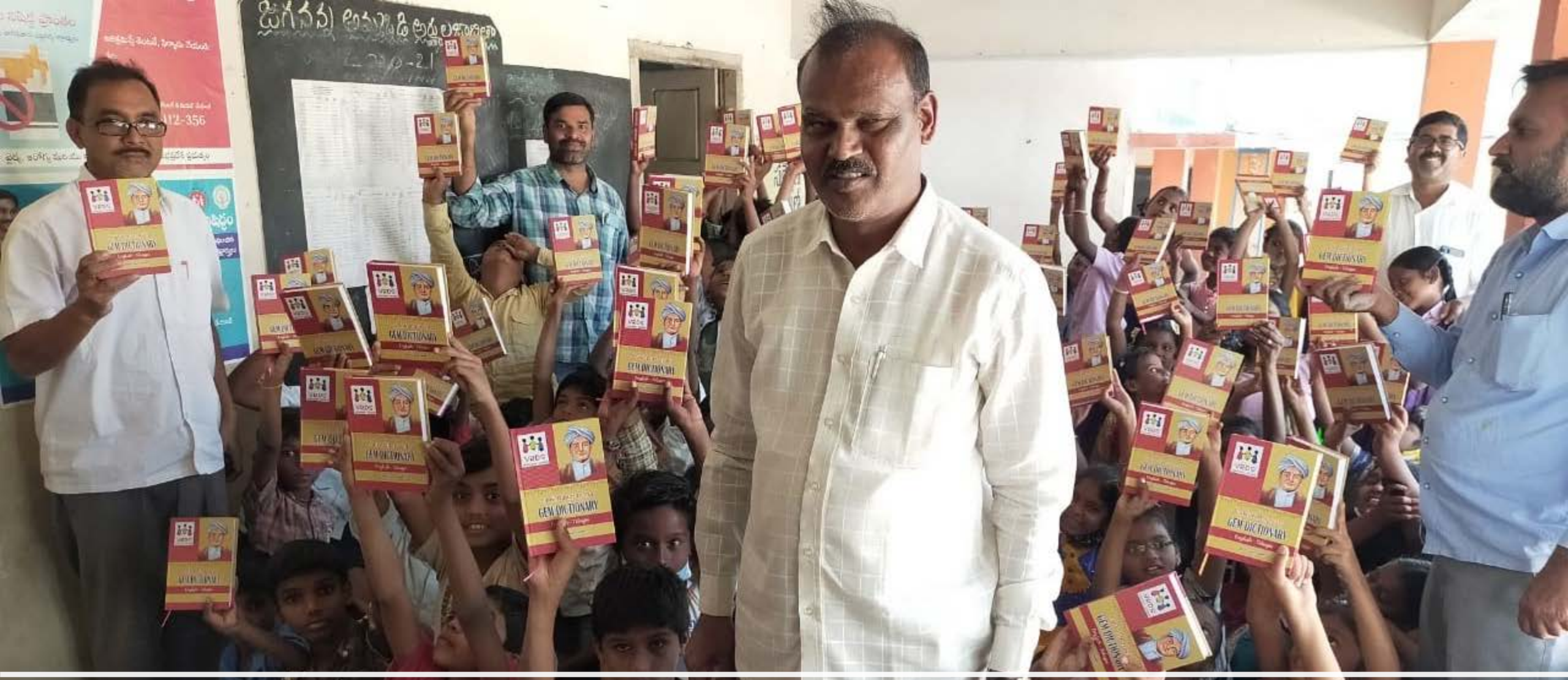
English to Telugu dictionaries for evening classes, Andhra Pradesh, India