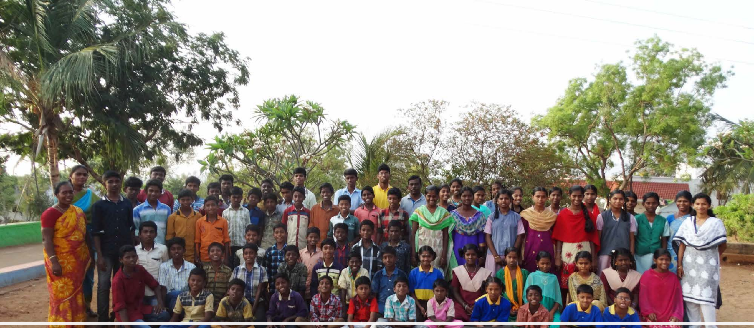
Deva Kirubai Social Help Association (DKSHA), Tamilnadu, India